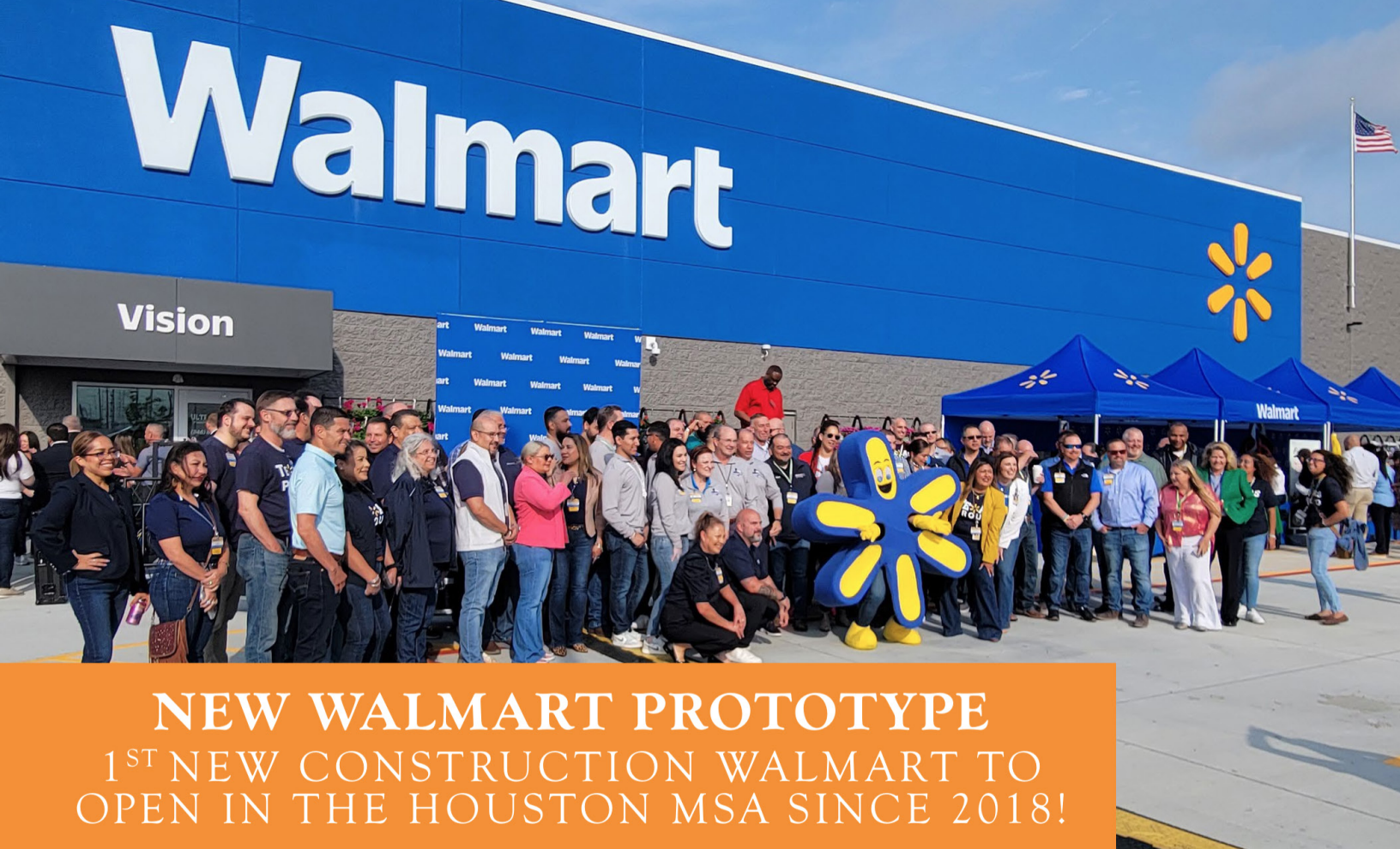
NEW WALMART PROTOTYPE 1 ST NEW CONSTRUCTION WALMART TO OPEN IN THE HOUSTON MSA SINCE 2018!